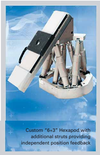
Custom "6+3" Hexapod with additional struts providing independent position feedback