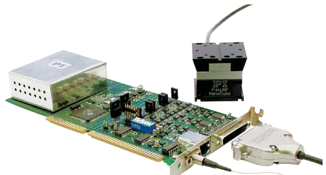
F-206.NCU Rapid NanoAlign Upgrade consists of the P-611 NanoCube® piezo nanopositioner and the E-760 controller card

the P-611.3SF XYZ piezo-drive NanoCube® (see p. 2-52) and the E-760 controller board (see p. 2-138), which is installed in the F-206 controller.