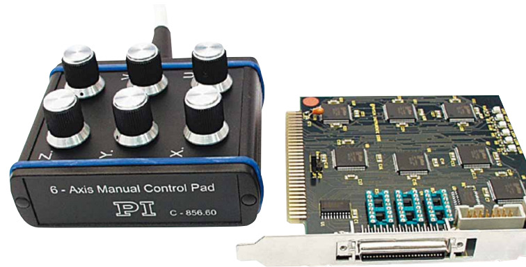
The F-206.MC6 manual control pad facilitates system setup and testing procedures. It permits independent motion in all degrees of freedom with programmable step size