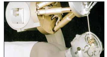
Custom Hexapod designed for neurosurgery Photo: IPA macro language for programming and storing command sequences.