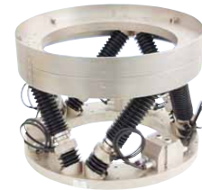
Custom water-resistant Hexapod