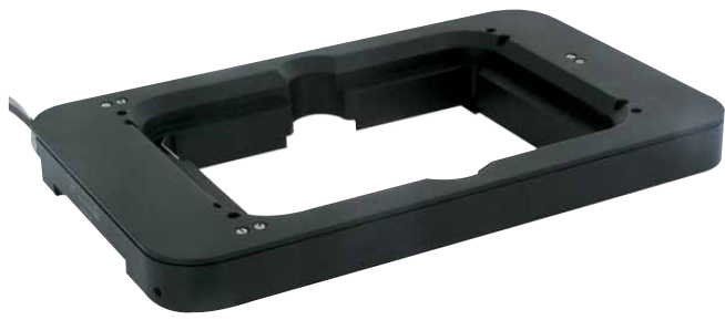
P-737 piezo Z-stage for high-resolution microscopy