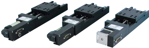
Different motor versions of the M-403 linear stage family with 100 mm travel range (from left) M-403.4PD (DC-motor/ActiveDrive™), M-403.4DG (DC-motor/gearhead) and M-403.42S (stepper motor)