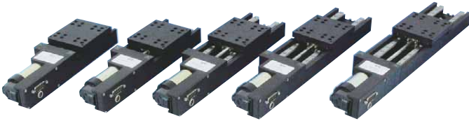
M-403 linear stage versions (from left) M-403.1PD, M-403.2PD, M-403.4PD, M-403.6PD und M-403.8PD provide travel ranges from 25 to 200 mm