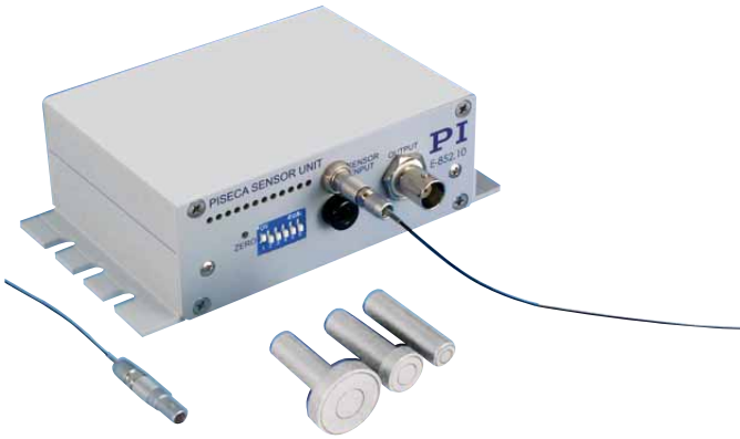
E-852 signal conditioner electronics with PISeca™ capacitive sensor probes D-510.100, D-510.050, D-510.020 (from left)