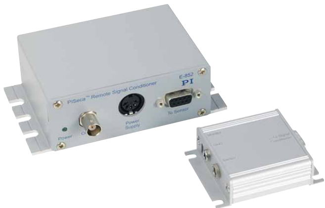
E-852.10A1 allows longer distances up to 10 m between sensor signal amplifier and signal conditioner. Other cable lengths on request

PISeca™ sensor electronics are equipped with I/O lines for the synchronization of multiple sensor systems.