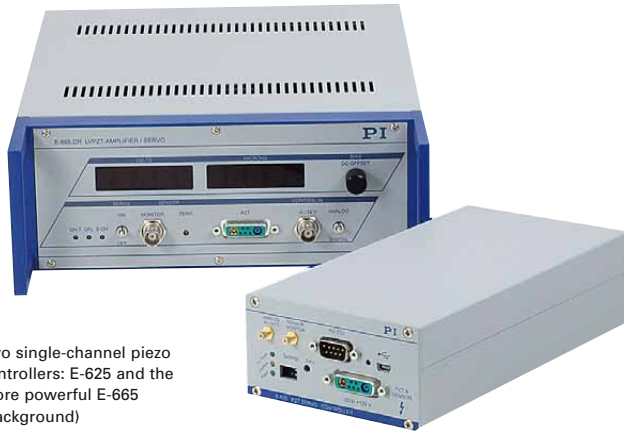
Two single-channel piezo controllers: E-625 and the more powerful E-665 (background)