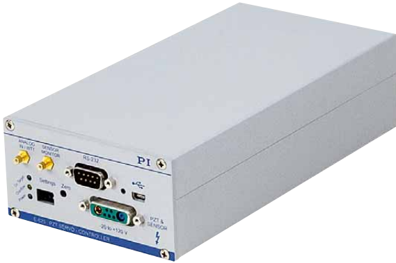
E-625.CR compact piezo servo-controller