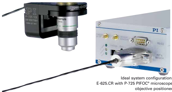
Ideal system configuration: E-625.CR with P-725 PIFOC® microscope objective positioner