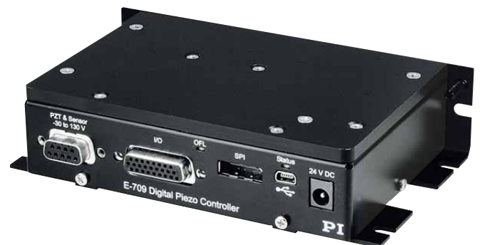
E-709 digital servo controller (preliminary case design); bench-top with digital interface