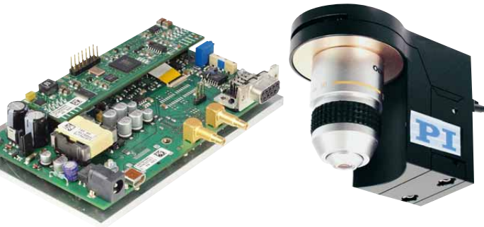
E-609 digital servo controller with a PIFOC® objective scanner