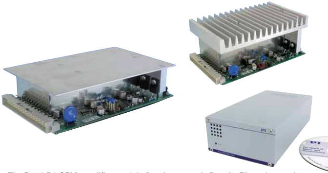
The E-413.D2 OEM amplifier module for piezoceramic DuraAct™ patch transducers (left). The piezo amplifier for piezo shear actuators is available as a bench-top version (E-413.00, front, right) or as an OEM module (E-413.OE, rear, right)