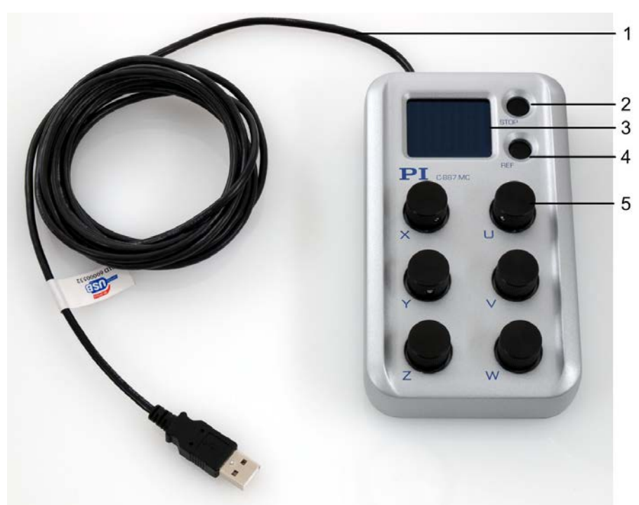
Figure 1: C-887.MC Hexapod control unit