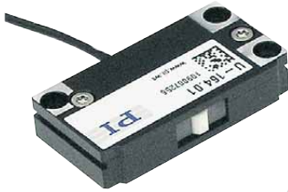
OEM ultrasonic piezo linear motor U-164.01