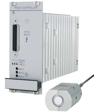
E-616 OEM steering mirror controller with S-334 tip/tilt mirror system