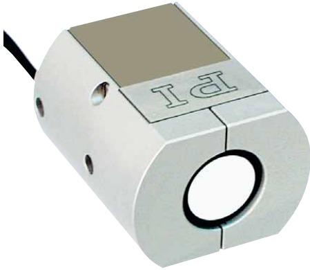
S-334 Tip/Tilt Mirror System / Scanner Provides Optical Deflection Angle up to 120 mrad