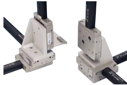
M-231 mounted on M-105 XYZ positioning systems

For higher loads and travel ranges, refer to the M-230 (see p. 1-46), M-235 (see p. 1-50) and M-238 (see p. 1-52).