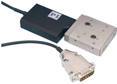
M-232.17 high-resolution DC-Mike actuator mounted on M-105 translation stage