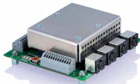
The E-870.41 allows the serial control of up to four PIShift or PiezoMike actuators through demultiplexing