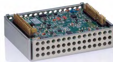
E-870.10: Single-channel driver for piezo inertia drives (to be plugged in or soldered)