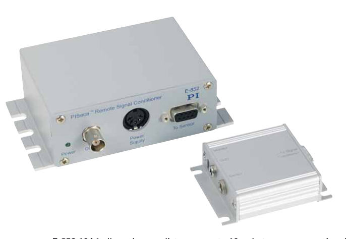
E-852.10A1 allows longer distances up to 10 m between sensor signal amplifier and signal conditioner. Other cable lengths on request

PISeca™ sensor electronics are equipped with I/O lines for the synchronization of multiple sensor systems.