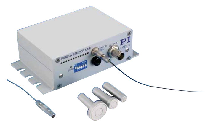
E-852 signal conditioner electronics with PISeca™ capacitive sensor probes D-510.100, D-510.050, D-510.020 (from left)