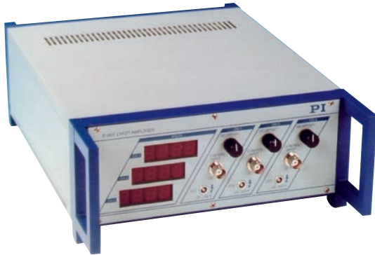
E-663.00 bench-top device