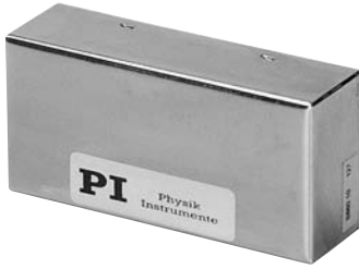
E-660.OE OEM Version