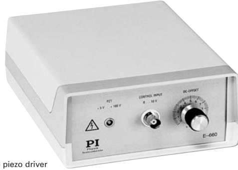
E-660.00 Bench-top piezo driver