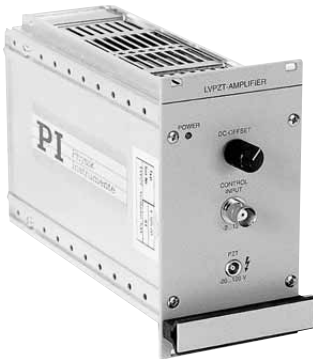
E-505.00 is a high-performance amplifier module for the piezo servo-controller system E-500