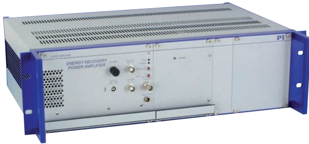
E-481.00 high-power amplifier, optionally available with E-509 servo-controller and E-517 interface and display module