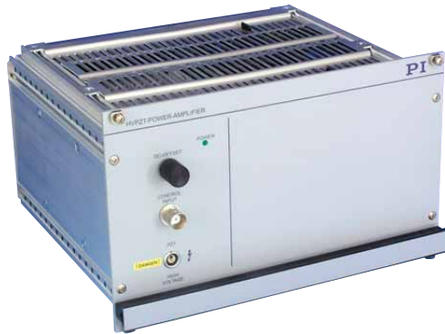
E-421.00 HVPZT piezo amplifier module

Please read details on Calibration Information (see p. 2-103).