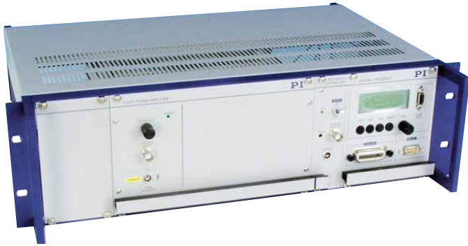
E-471 Configuration example: E-471.20 HVPZT amplifier, with optional E-509 PZT servo-controller and E-516 20-bit DAC interface/display