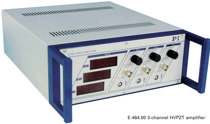
E-464.00 3-channel HVPZT amplifier