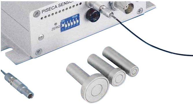
PISeca high-precision capacitive sensor probes with E-852 signal conditioner electronics. Sensor probes (from left): D-510.101 with 100 \mu\text{m} , D-510.051 with 50 \mu\text{m} , D-510.021 with 20 \mu\text{m} nominal measurement range