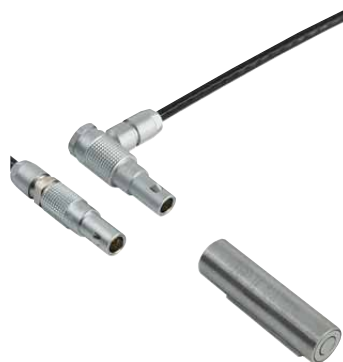
D-510.021 with LEMO connector for easy handling

Single-electrode capacitive (capacitance) sensors are direct metrology devices. They use an electric field to measure change of capacitance between the probe and a conductive target surface, without physical contact. This makes them free of fric-