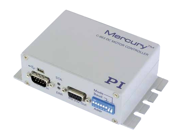
The C-863 Mercury DC servo controller features USB and RS-232 interfaces and incremental encoder signal processing at 20 MHz bandwidth