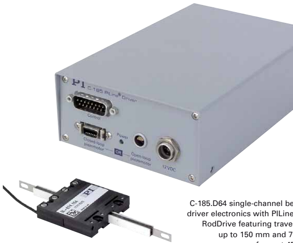
C-185.D64 single-channel bench-top driver electronics with PLine® M-674 RodDrive featuring travel ranges up to 150 mm and 7 N drive force at 450 mm/s