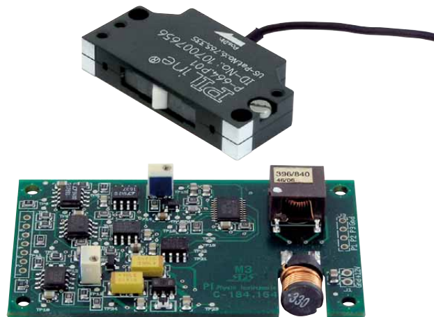
C-184.164 OEM driver board with PLine® P-664 OEM motor