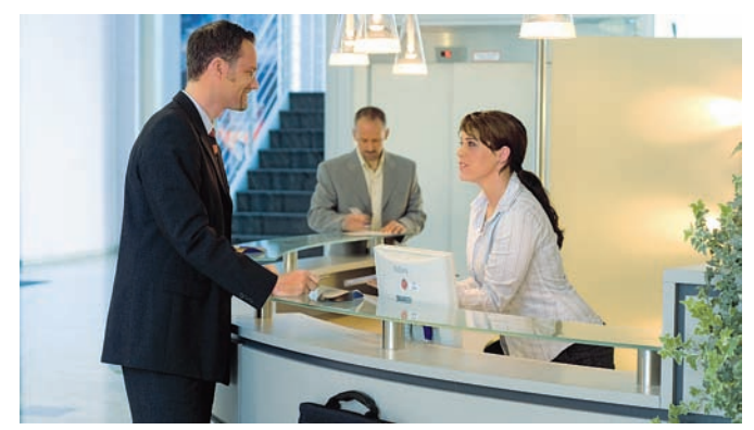
PI reception desk: Our employees look forward to your visit

PI is market and technological leader for precision positioning systems with accuracies well under one nanometer. Nanometer-range motion control is the key to worlds where millions of transistors fit on one square millimeter, where molecules are manipulated, where thousands of "virtual slices" are made in the observation of living cells, or where optical fiber bundles no larger than a human hair are aligned in six degrees of freedom.