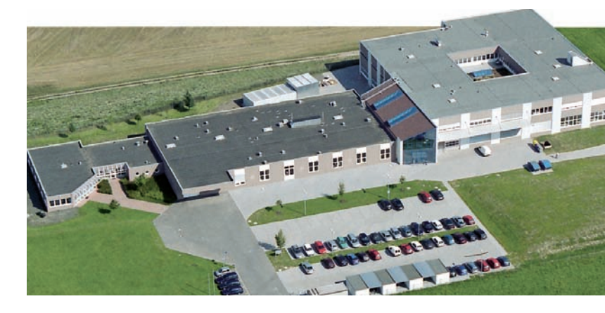
PI Ceramic – a PI Subsidiary – is a world-class supplier of highperformance piezoelectric actuator and transducer components and subassemblies.

We measure the quality and reliability of our products against the strictest of standards. ISO 9001 certification, which also emphasizes points like customer expectations and satisfaction, has been accorded in 1994, making PI the first manufacturer of nanopositioning technology following this standard. PI's Integrated Management System (IMS) includes also Environmental Protection and Job Safety (according to ISO 14001:2004 and OHSAS 18001:1999). This system assures legal conformity of all procedures as well as continuous optimization of the processes at all PI locations. PI brands and colors are well known throughout the high-tech world. PIFOC® is almost used as a synonym for objective positioners in general and PICMA® stands for the highest reliability in piezo actuator products. PI stands for quality and precision - worldwide.