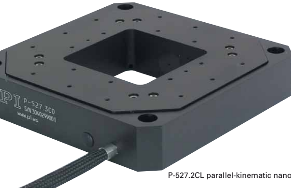
P-527.2CL parallel-kinematic nanopositioning system